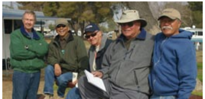
Our Luau Cooks

Place Spam flat side into casserole dish. Criss-cross 1 inch deep cuts on Spam. Pour beans around Spam. Place 1 pineapple ring on Spam. Place balance of rings on beans. Put 6 cloves on Spam and 1 clove on each pineapple ring cover and bake 30 minutes at 350 degrees.