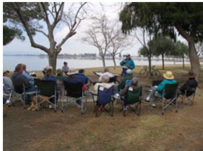
We squeezed in a Computer Meeting