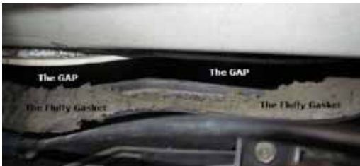
The Gasket Up Close

The heater duct and gasket are just above the air conditioning tubing and the heater blower. On the left there is hardly any room at all for fingers let alone tools. I removed the bolts for the Windshield Washer Fill Tube and the Oil Fill Tube and popped the white plastic rivet holding the Wiring Harness to give me some more room. You can use most any configuration of foam to plug the "Gap".