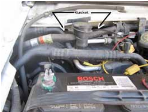
The Gasket Location