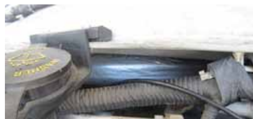
The "Fix" in Place?

Then I forced my new gasket into the gap along the front of the duct from left to right and around the right side of the duct. The fluffy gasket in the back seemed to be intact so I did not worry about it. I put many vertical strips of duct tape across the gasket to keep the gasket in place.