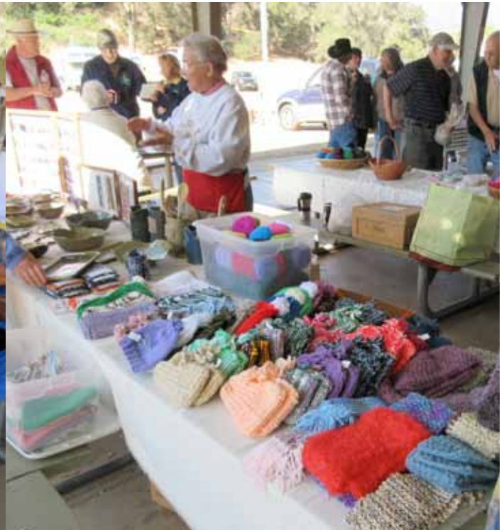
Our May Craft Sale was enjoyed by all with many fine quality products.