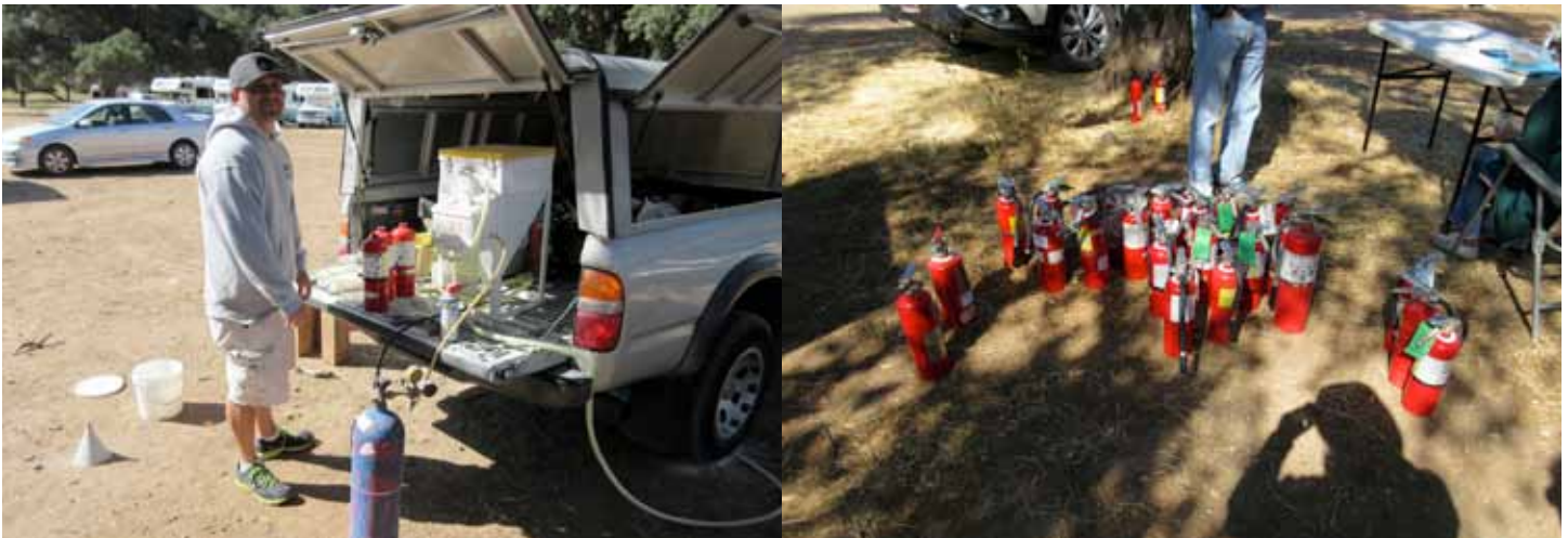
Extinguisher sales and recharge to keep us safe at Live Oak