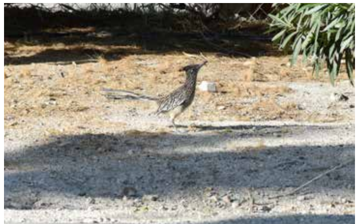
Our camping companion, the Roadrunner.